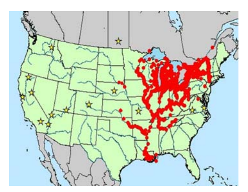
Figure 2 zebra mussel distribution in 2005