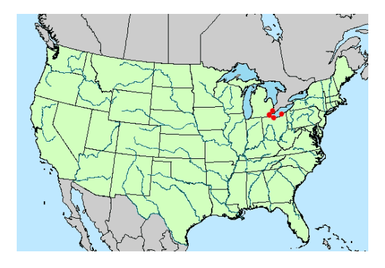
Figure 1 zebra mussel distribution in 1988. (stars represent mussel interdictions).

Potential Scope. There is significant potential for exponential spread of quagga/zebra mussel populations to infest/invade western waters of North America. Using zebra mussels in the Great Lakes as a indicator (see figures 1 and 2), the Quagga mussel infestation documented at Lake Mead NRA could spread to other western waters if active measures are not immediately taken. These measures should include: assessment, monitoring, education, and control/management. Each affected entity/jurisdiction will have different priorities based on their basic mission; many of these will overlap, some may be in conflict. Based on these priorities, agency response actions will vary. Sorting thru the complex web of jurisdictions will be necessary to coordinate productive and cost effective actions.